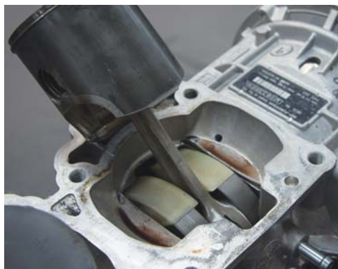
The pistons suffered only minor scuffing.