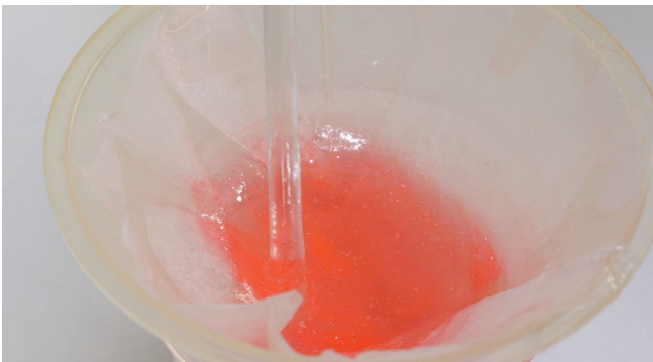
Wax formation in untreated diesel fuel plugs a coffee filter.