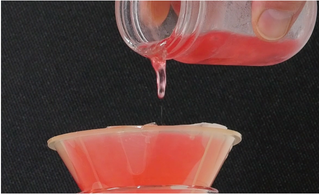
Wax formation in untreated diesel fuel resists pouring.

lowers the cold filter-plugging point (CFPP) by up to 40°F (22°C) in ULSD.