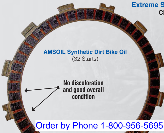
AMSOIL Synthetic Dirt Bike Oil (32 Starts)

No discoloration and good overall condition