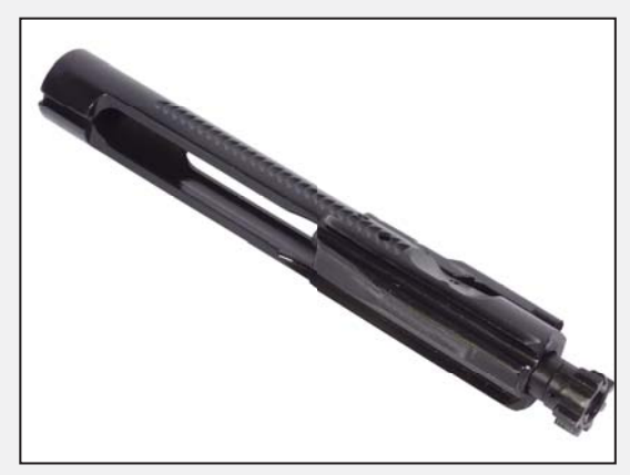
AMSOIL Synthetic Firearm Lubricant provided exceptional performance over rigorous range testing in multiple firearm applications.