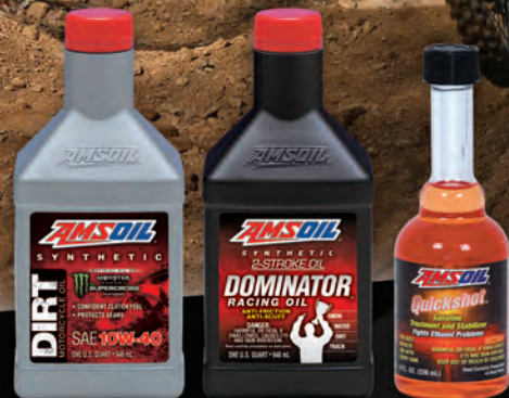
SYNTHETIC 4-STROKE OIL