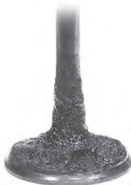
Intake Valve before P.i. Treatment