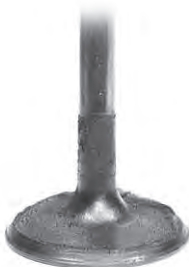
Intake Valve after P.i. Treatment